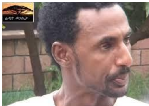
Radio wega, to sallina August 2018